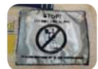
Activated wash indicator