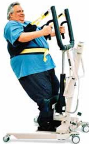
Care Bar Stand-N-Weigh®