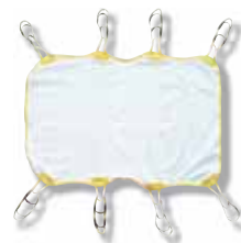
Disposable Repositioning Sling

Make sure you are using slings & belts with the highest level of protection. Look for this tag.