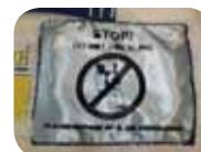
Activated wash indicator