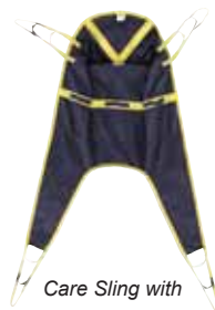
Care Sling with Head Support (Polyester)