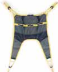
Care Sling (Mesh)